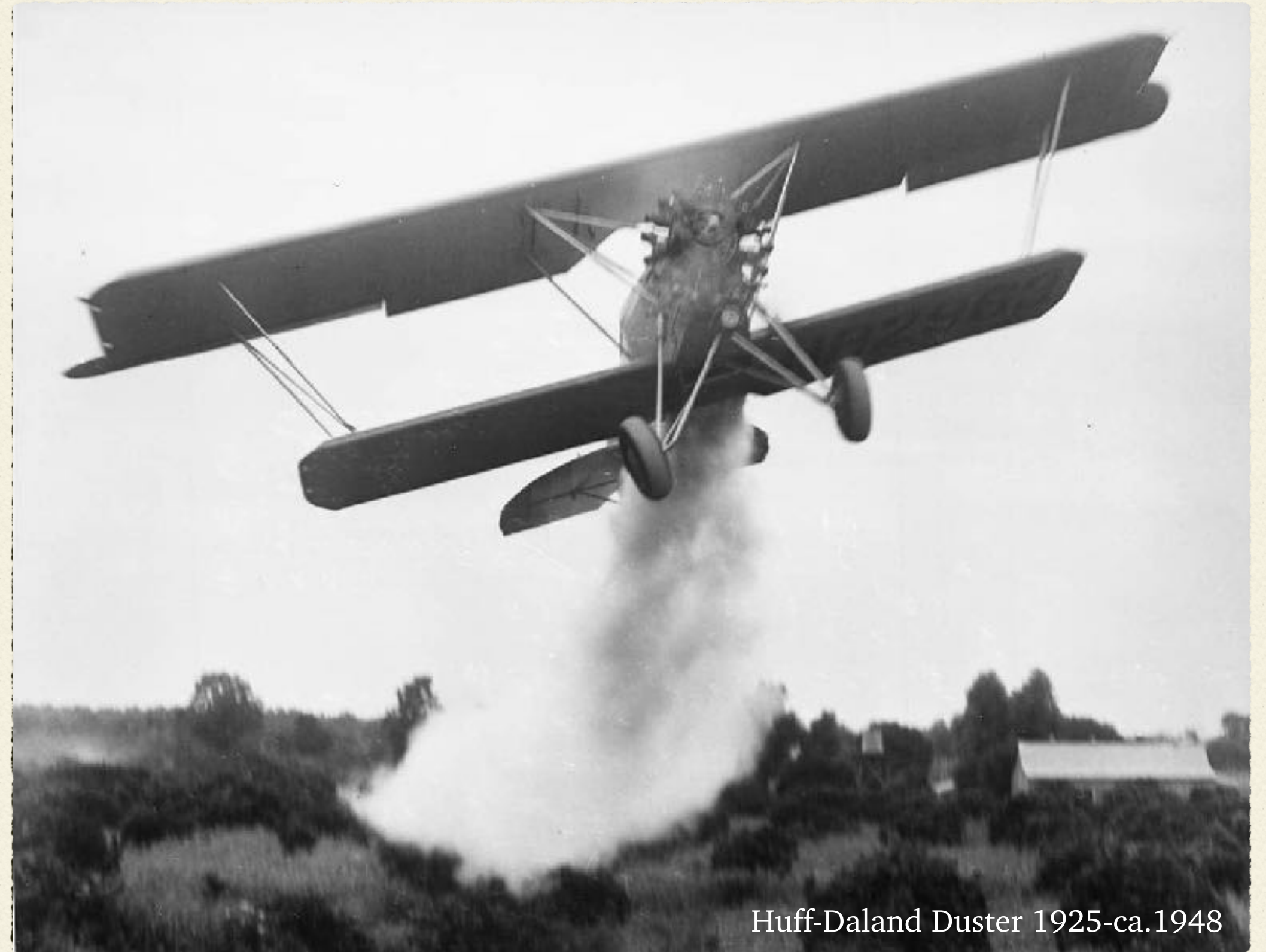
Huff-Daland Duster 1925-ca.1948