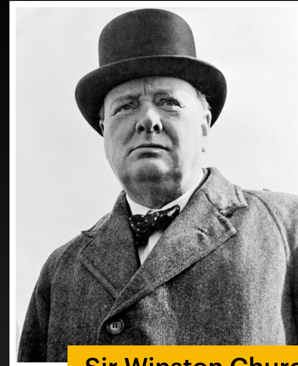
Sir Winston Churchill

(Churchill, 1975/1925, p. 3706 as cited in Winston Churchill, 2024)